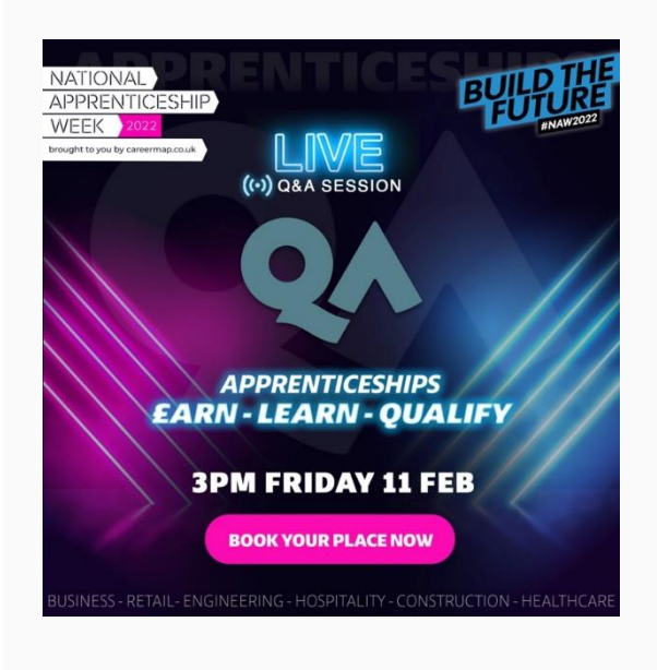
Dstl – Apprenticeships that Help Keep the UK Safe