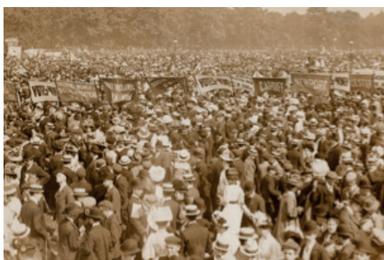
Aftermath of suffragette window-smashing