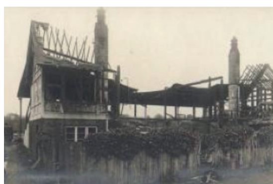
Building destroyed in suffragette arson attack